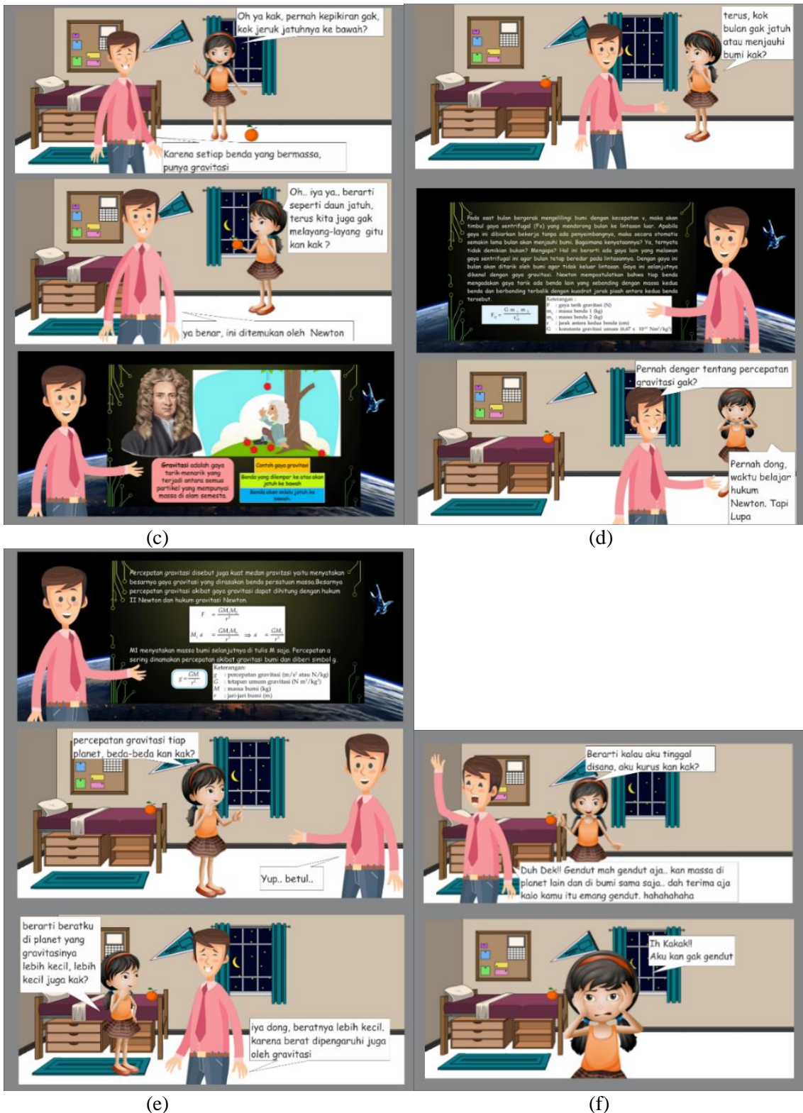
Figure 2. Comic display on page (a) 1; (b) 2; (c) 3; (d) 4; (e) 5; (f) 6.