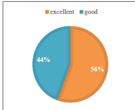
Figure 4. Students's Learning Motivation Based on Observations

Motivation mapping based on observations made by the teacher is presented in Figure 4.